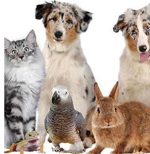
MORE BIRDS OF A FEATHER An NCPA ANTHOLOGY A Collection of Short Stories about Animals and Other Things