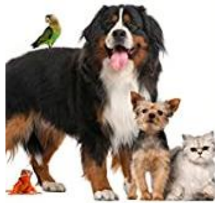
BIRDS OF A FEATHER An NCPA Anthology A Collection of Short Stories about Animals