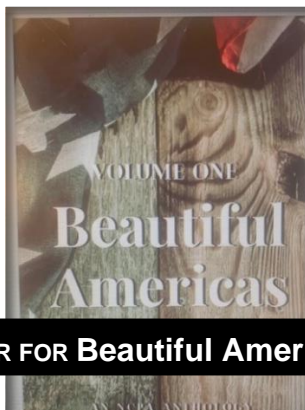
COVER FOR Beautiful Americas Vol 1

Sharon@SharonSDarrow.com OR NCPA Anthologies (5 book series) Ebook & Paperback Edition (amazon.com)