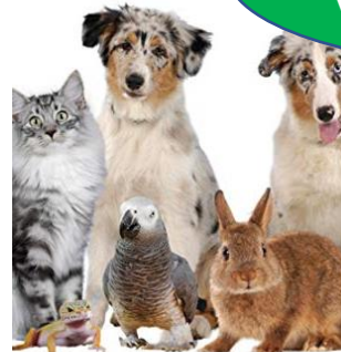
MORE BIRDS OF A FEATHER An NCPA ANTHOLOGY A Collection of Short Stories about Animals and Other Things