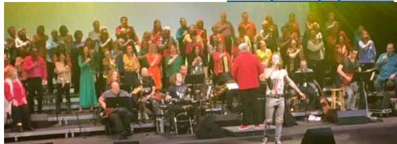
Placer Pops Chorale & Orchestra upcoming performances in 2019: www.placerpops.com

“Hollywood at Harris Center” A Night of Academy Award Winning Music