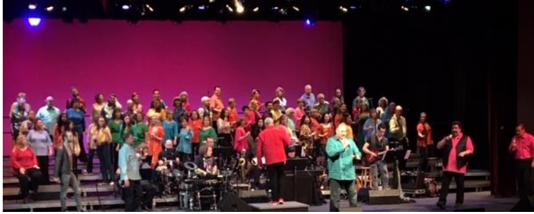
Placer Pops Chorale and Orchestra during the 5 May 2019 “Best of Classic Rock” performance at the Dietrich Theatre in Rocklin * www.placerpops.com